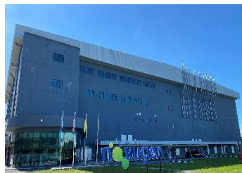
Novugen Pharma Manufacturing Plant

Novugen Pharma & Novugen Oncology finished dosage form (FDF) manufacturing plant