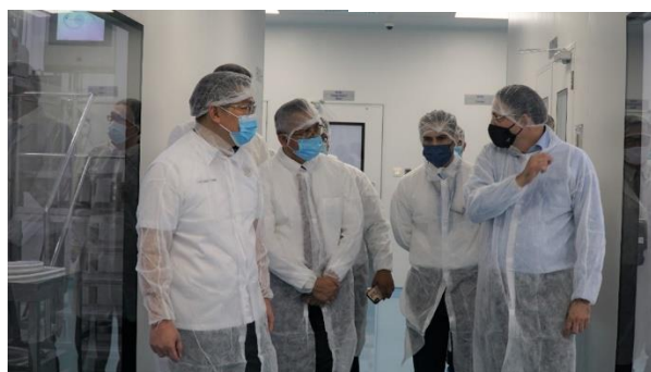
18 March 2021 - Delegations during the tour of Novugen Pharma manufacturing facilities.