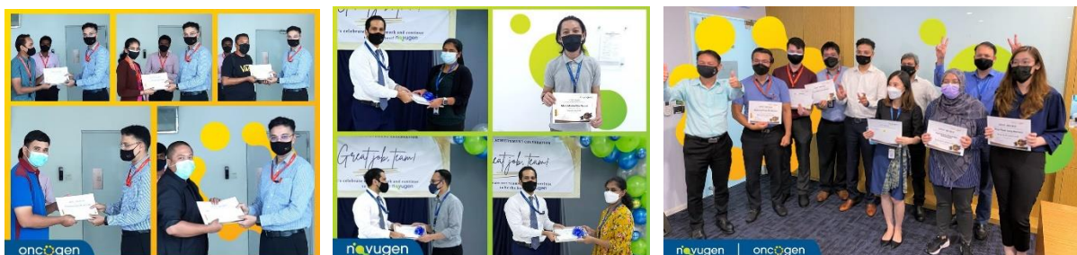
SPOT Award recipients

To foster T.R.I.C.E. in the company, SPOT Award was recently established as a platform that not only recognizes exceptional contributions of our colleagues, but also to applaud their work ethics which displays the company’s core values.