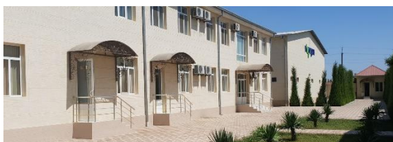
Synergy II – FDF Manufacturing Facility, Uzbekistan

Novugen Pharma has become the first pharmaceutical company in ASEAN with the capability to design complex generics as per the USFDA standards. Besides USFDA, the company is also the first in ASEAN to undergo accreditations from EU and PIC/S and WHO GMP.