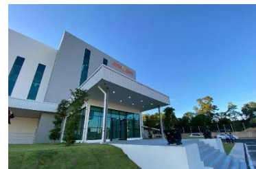
Novugen Oncology Manufacturing Plant