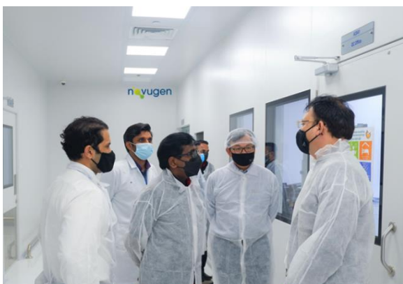
11 November 2021 - Delegations during the tour of Novugen Pharma manufacturing facilities.

"Our goal is to be a game changer in Malaysia's healthcare landscape. In the country, 60% of our drugs are imported from other countries, especially high valued drugs such as chronic care and cancer treatment. Hence, manufacturing these drugs locally, narrows Malaysia's foreign deficit. Additionally, we target to catapult the country to become a global player in the pharmaceutical landscape by exporting our products to over 75 countries."