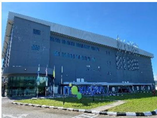
Novugen Pharma Manufacturing Facilities at Bandar Enstek Negeri Sembilan