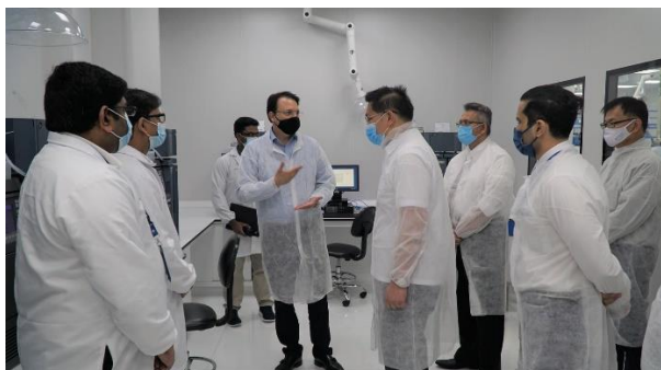
18 March 2021 - Delegations during the tour of Novugen Pharma manufacturing facilities.