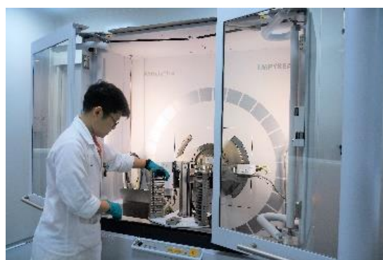
Novugen Oncology Laboratory

In Malaysia itself, the pharmaceutical industry is valued at more than USD2billion in 2019 with over 100 pharmaceutical companies setting foot in the country. As a result, not only more employment opportunities will be created, but future scientists will also have the chance to hone leading-edge industry know-how, raising the industry's standard in Malaysia.