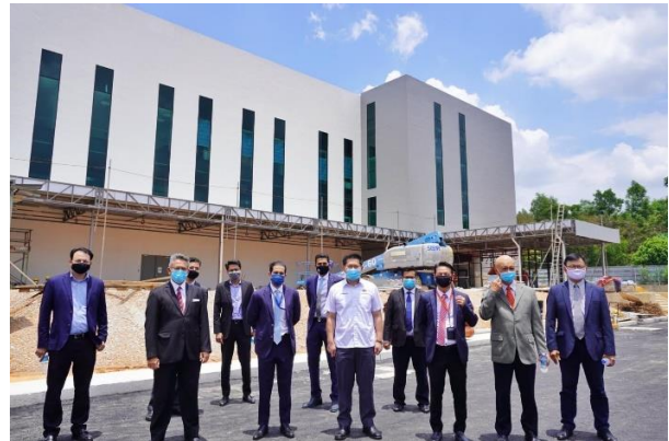
18 March 2021 - Group photo of the delegations in front of the Novugen Oncology manufacturing facilities.

Novugen Pharma Sdn. Bhd. Novugen Oncology Sdn. Bhd.