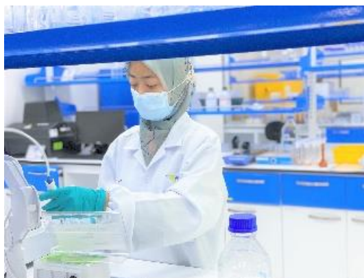
Novugen Pharma Laboratory

With over 70 complex generic products, Novugen Pharma and Novugen Oncology cater to all therapeutic areas with a pipeline of over 25 prescription drugs for US market. The diversified portfolio includes technology intensive products in a wide range of disease areas including Urology, Cardiology, Anti-inflammatory, Haematology, Anti-infective, Endocrinology, Gastroenterology, CNS, and Oncology.