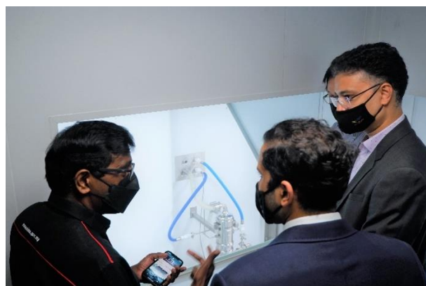
11 November 2021 - Delegations during the tour of Novugen Oncology manufacturing facilities.