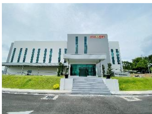
Novugen Oncology Manufacturing Facilities at Bandar Enstek Negeri Sembilan

With over 70 complex generic products, Novugen Pharma and Novugen Oncology cater to all therapeutic areas with a pipeline of over 25 prescription drugs for US market. The diversified portfolio includes technology intensive products in a wide range of disease areas including Urology, Cardiology, Anti-inflammatory, Haematology, Anti-infective, Endocrinology, Gastroenterology, CNS, and Oncology.